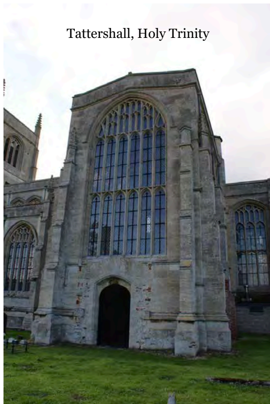
Tattershall, Holy Trinity