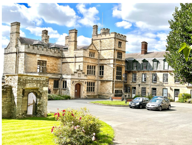
Edward King House

Our aim is to grow the Church, in both numbers and depth, through attention to what we see as our core tasks of faithful worship, confident discipleship and joyful service, with the vision of being a healthy, vibrant, sustainable church which leads to transformed lives and communities across greater Lincolnshire making a difference in God's world. To that end as a diocese we shall support, encourage and enable local parishes, schools and mission partnerships to fulfil, within this framework, their own unique calling to serve in mission the community in which they are set.