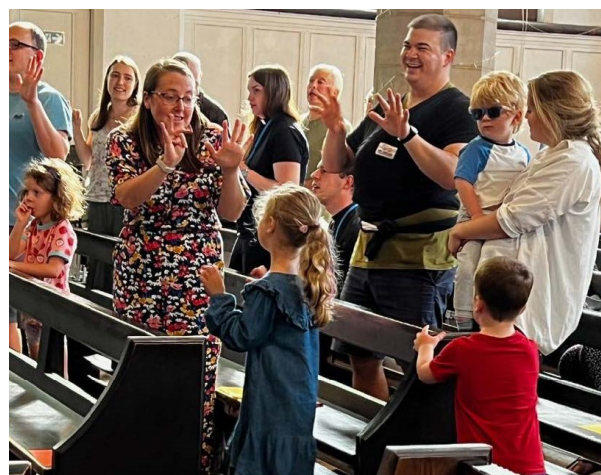
Worship for everyone at St Faiths in Lincoln

Time to Change Together, an integrated approach to growth, deployment, staffing, costs, investments, and voluntary giving launched in 2022, is starting to deliver major benefits in terms of working practice and support for our voluntary and paid staff in the parishes, and in levels of income and in care of our precious and vast range of church buildings, that they better serve the community in which they are set.