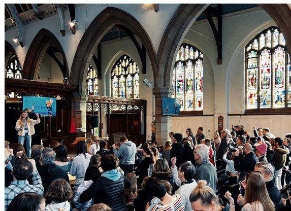
Worship in the Diocese of Lincoln

The diocese through its churches, chaplaincies and projects is deeply committed to the flourishing of the whole population and embedded in every community across Greater Lincolnshire. Through, for example, our church schools growing children, young people and households we are committed to healthy, inclusive structures in society. The diocesan environmental policy, including a commitment to carbon net zero by 2030, informs all our work from buildings and investments to ministerial and faith training. We have a carefully implemented ethical investment policy for our historic assets. The diocese invests heavily in continuously improving the quality of our safeguarding performance.