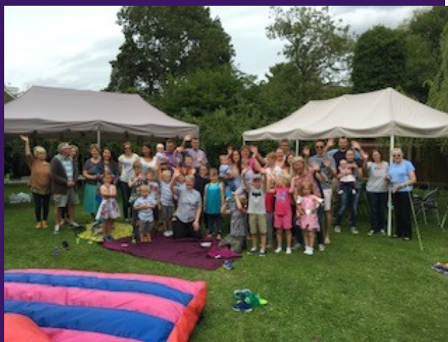
Baptism BBQ at the Vicarage