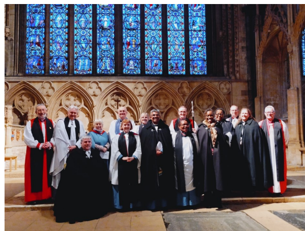
2023 Racial Justice Sunday service at Lincoln Cathedral