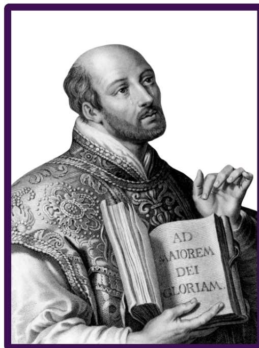
St. Ignatius Loyola

Lord Jesus, teach me to be generous; teach me to serve you as you deserve, to give and not to count the cost, to fight and not to heed the wounds, to toil and not to seek for rest, to labour and not to seek reward, except that of knowing that I do your will. Amen.