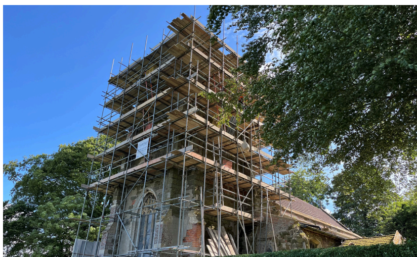
Repairs to the tower, Little Steeping

This scheme enables those caring for listed churches to claim back the VAT on repairs and some other capital project work. The fund has been capped at £23 million pounds for the year. Places of worship will not be able to claim more than £25,000 in any one year. The scheme receives around 7,000 applications a year, of which more than 70% are for £5,000 or less.